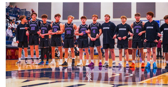
MCHS Boys Basketball at Mount Aloysius College for District Championship