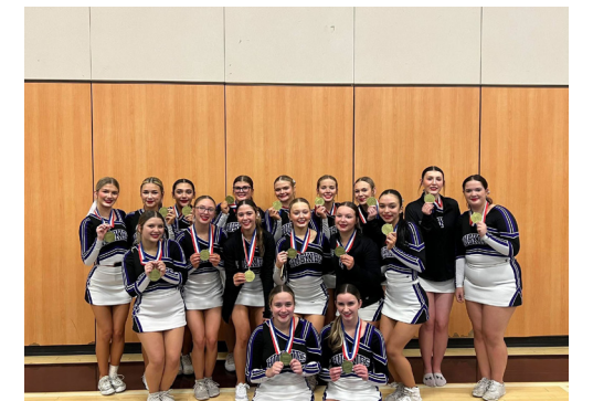
MC Varsity Cheer after winning District VI title