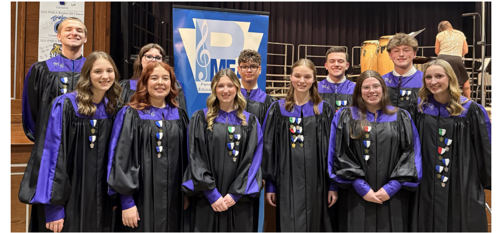
MCHS Choir at the PMEA music competition

"Preparing students for festivals is about teaching them how to practice efficiently. It is also about making sure students know what to expect during the audition process," said choir director