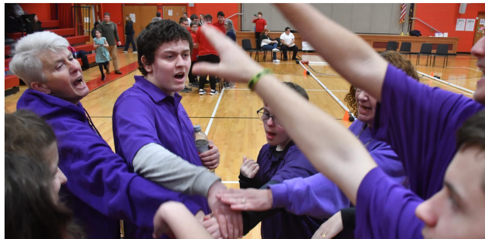
MCHS Coed Unified Bocce team at an in-season match