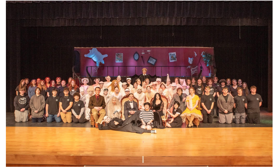
MCHS Drama Club poses on the stage in costume for the production of the play

she enjoys, “Helping to create what always becomes an awesome final product.”