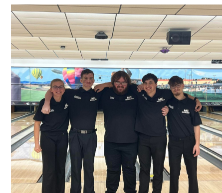
Mifflin County Bowling team poses for pictures during in season competitions