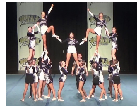
MC Varsity Cheer at PIAA State Championships