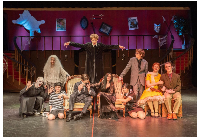
Main characters of The Addams Family Musical in costume