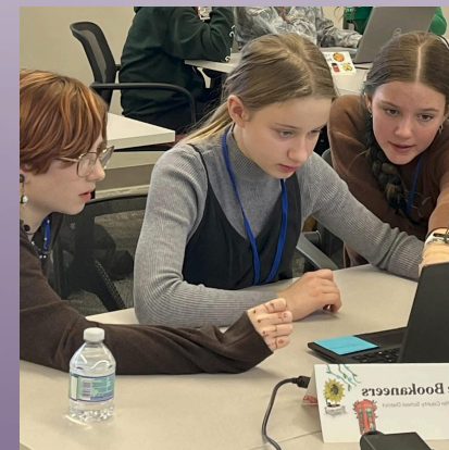
Leading in Reading