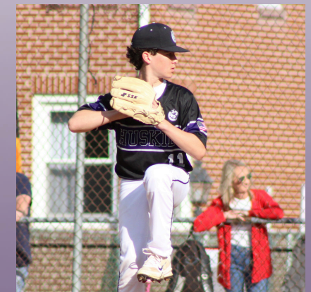
Stepping to the Plate