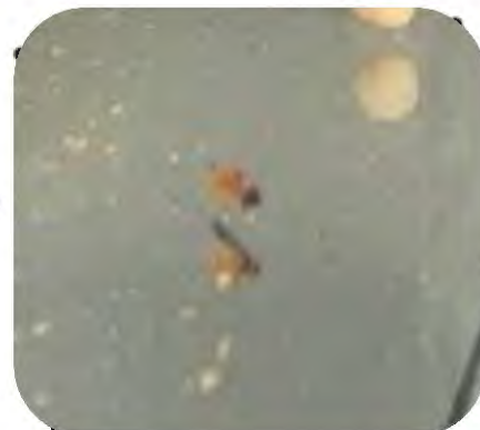
to sac fry...