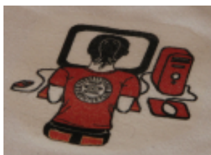
Charity's logo design