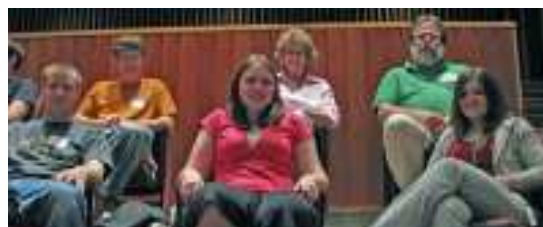
The team views the awards assembly.